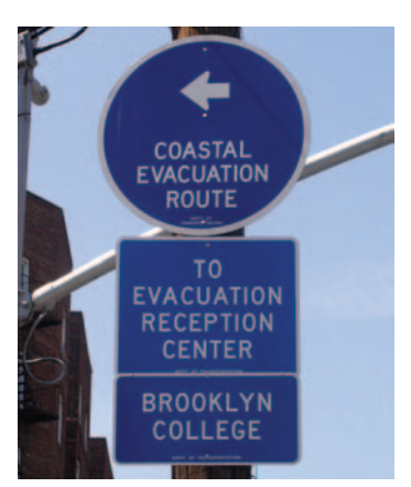
Coastal evacuation signs, which direct traffic to reception centers, are being installed along evacuation routes throughout the City.

To ensure the most efficient use of resources, the City