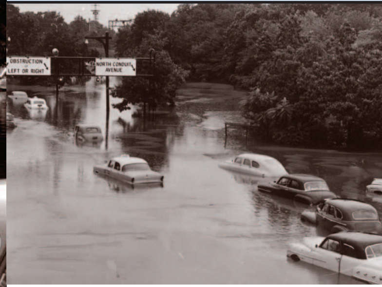
Belt Parkway at Sunrise Highway, Queens, 1960.

Recent research indicates that due to regional geography, burricanes in New York City - though infrequent - can cause far more damage than burricanes of similar strength in the southern United States. It's important to be prepared to respond quickly. The New York City Office of Emergency Management works to ensure the City is prepared for coastal storms and burricanes. Read on to learn more about how you can prepare for a burricane in New York City.